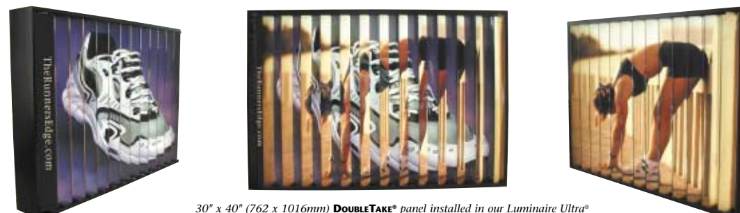
30" x 40" (762 x 1016mm) DOUBLETAKE® panel installed in our Luminare Ultra® graphic display illuminator. The "jumbled" image viewed from the straight-on perspective often piques viewers' attention, causing them to shift viewing angles.

► DOUBLETAKE® Our latest prismatic display innovation presents two images in the space of one, via its patented "zigzag" face profile. As the prospect walks by the display (or as the panels rotate across his point-of-view in our IMPACT ISLAND® display—see our website) he sees a metamorphosis take place as one image transitions into another. Viewers are typically captivated, and often position themselves to view the action repeatedly.